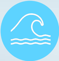
Water & Wastewater