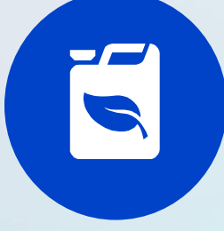
Low Carbon Fuels